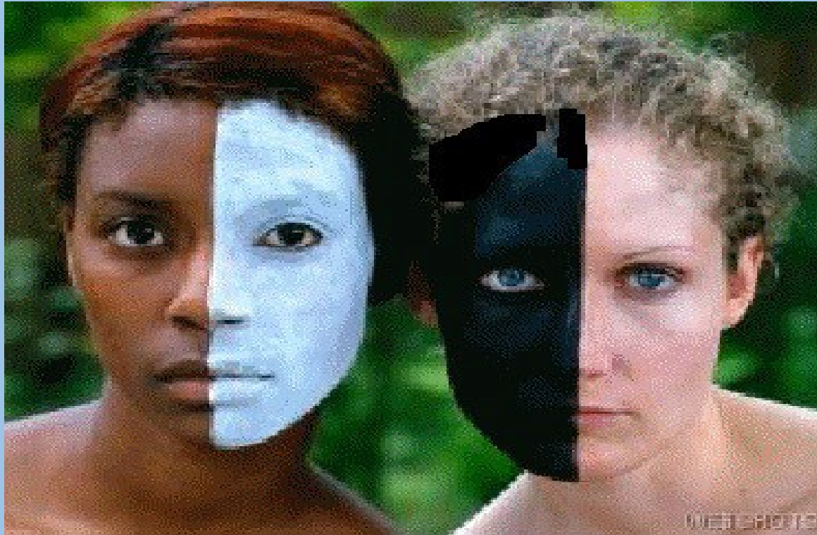
Team "DARWIN" Rome , Italy